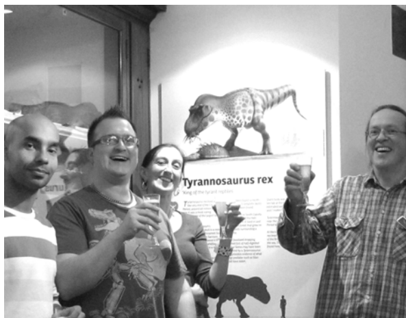
Members of the project team celebrate the installation of the completed panels